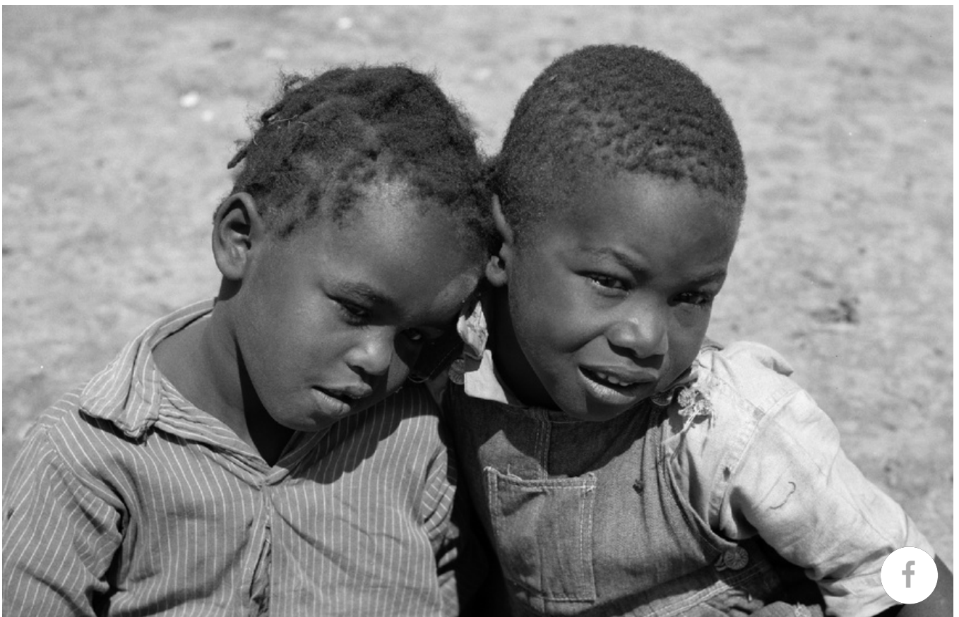
Sharecropper boys in 1936